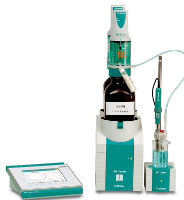
Figure 1. 905 Titrando equipped with a Solvotrode easyClean for the analysis the epoxide equivalents controlled by a 900 Touch Control.

This non-aqueous titration is performed on a 905 Titrando system equipped with a magnetic stirrer and a Solvotrode easyClean for indication. The sample is weighed into a titration beaker, and then dissolved in either chloroform or methylene chloride. Afterwards, TEABr reaction solution and glacial acetic acid are added, and the sample is titrated with standardized perchloric acid until after the equivalence point is reached.