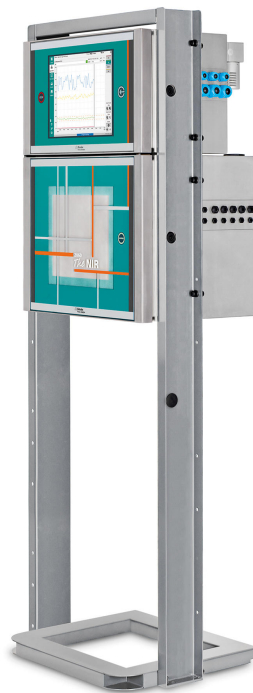
Figure 3. 2060 The NIR Analyzer from Metrohm Process Analytics.