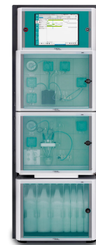
Figure 2. 2060 Process Analyzer.

In order to extract the proper compounds, keep the pH within specifications, and brew the same flavors over multiple batches, both alkalinity and hardness of the process and make-up water must be monitored and kept at proper levels. The Metrohm Process Analytics 2060 and 2035 Process Analyzers ( Figures 2 and 3 ) are ideally suited for the fully automatic execution of these important analyses, as well as additional parameters like pH or conductivity. The process analyzer can send an alarm to the plant control system if alkalinity or hardness levels are not optimal, signaling the distribution control to correct the water chemistry, ensuring consistent product quality.