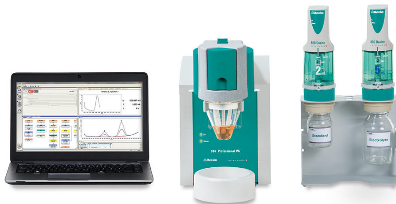
Figure 2. 884 Professional VA, semiautomated for VA analysis