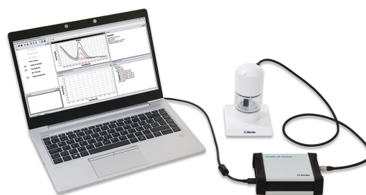
Figure 1. 946 Portable VA Analyzer

Prior to the first determination, the ex-situ mercury film is deposited on the scTRACE Gold electrode. In the next step, the electrodes are cleaned with ultrapure water and the measuring vessel is emptied. The water sample, the supporting electrolyte with the complexing agent (DTPA) are pipetted into the measuring vessel. The determination of chromium(VI) is carried out with a 946 Portable VA Analyzer using the parameters specified in Table 1 . The concentration is determined by two additions of a chromium(VI) standard addition solution. The scTRACE Gold is electrochemically activated prior to the first determination.