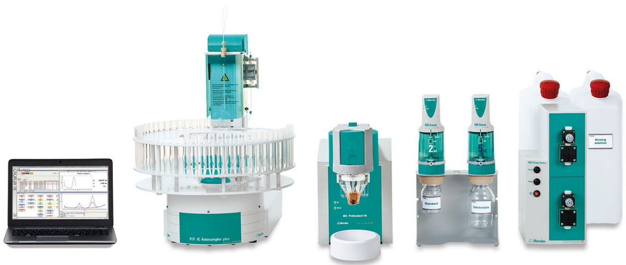
Figure 2. 884 Professional VA fully automated for VA analysis