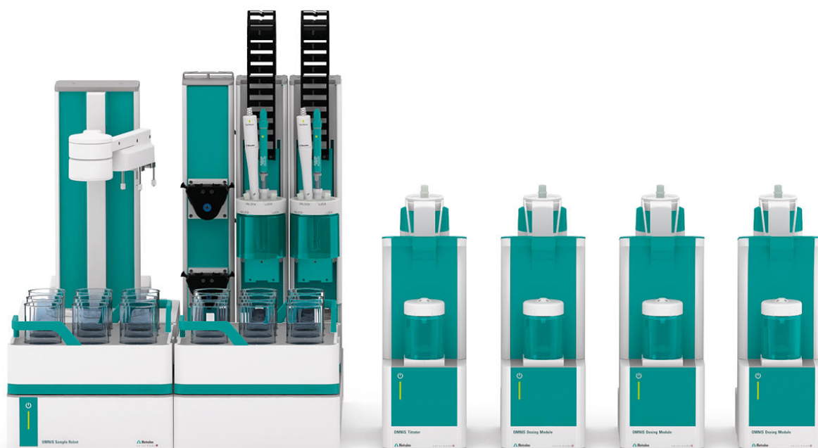
Figure 1. OMNIS Sample Robot S with an OMNIS Titrator and three Dosing Modules. Not pictured: additional OMNIS Sample Robot with Titrator and Dosing Modules as well as required Dosing Interface and Dosinos.