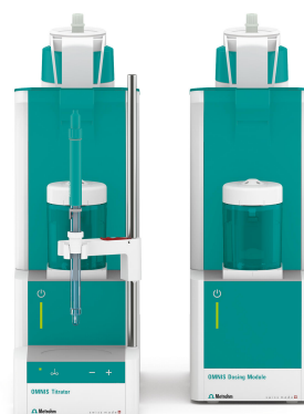
Figure 1. OMNIS system for the measurement of saponification value in edible oils consisting of an OMNIS Advanced Titrator and an OMNIS Dosing Module equipped with a dSolvotrode.

The prepared sample solution is first allowed to cool down to room temperature. Next, the buret tips as well as the electrode are inserted into the conical flask. Ethanol is added, and then the solution is titrated with standardized hydrochloric acid until after the equivalence point is reached. Afterwards, the electrode is cleaned with ethanol and deionized water. The electrode is then conditioned by immersing the bulb alone in deionized water for 1 minute.