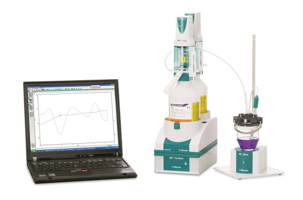
Figure 1. 859 Titrotherm setup for the thermometric titration and the data evaluation performed with tiamo.

An appropriate amount of sample is weighed precisely into the titration vessel. Deionized water is added to dissolve the sample, which is then titrated until after the exothermic endpoint with standardized STPB is reached.