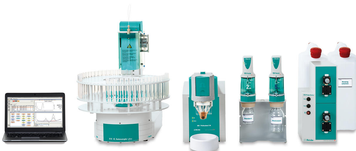
Figure 1. 884 Professional VA fully automated for VA

added, and the simultaneous determination of nickel and cobalt is carried out with the 884 Professional VA using the parameters specified in Table 1 . The concentration is determined by two additions of a nickel and cobalt standard addition solution.