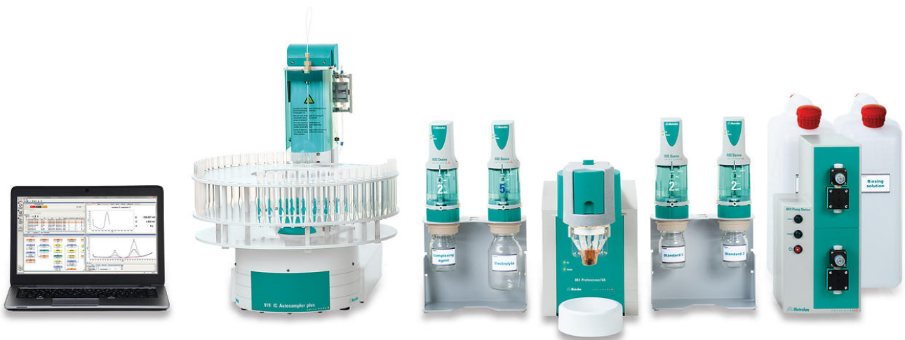
Figure 2. 884 Professional VA fully automated for VA