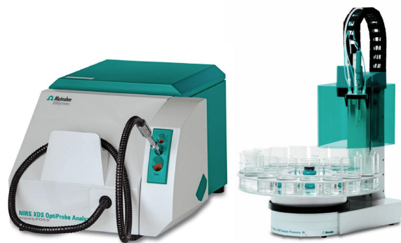
Figure 1. The NIRS XDS OptiProbe Analyzer and the 815 Robotic Sample Processor.

17 spectra of samples with varying moisture content were collected using a Metrohm NIRS XDS OptiProbe Analyzer in combination with the 815 Robotic Sample Processor. With the attached large sample rack, it was possible to automate measurements of up to 62 samples in series. The reference values were obtained by KF-titration. The data set consisting of spectra and lab values was split into a calibration set (11 samples) and validation set (6 samples). Outlier detection was performed on pre-treated spectra (2 nd derivative) using a maximum distance in wavelength space algorithm.