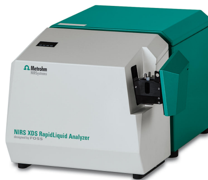
Figure 1. The NIRS XDS RapidLiquid Analyzer with a 1 mm quartz cuvette, used to collect the spectra of surfactant samples.

A total of 37 samples with varying surfactant content were provided by a customer. The Vis-NIR spectra (Figure 2) were acquired on a Metrohm NIRS XDS RapidLiquid Analyzer equipped with 1 mm quartz cuvette (Figure 1). The samples were measured as-is, without any sample preparation steps. Data collection and model development was carried out with the Vision Air complete software package.