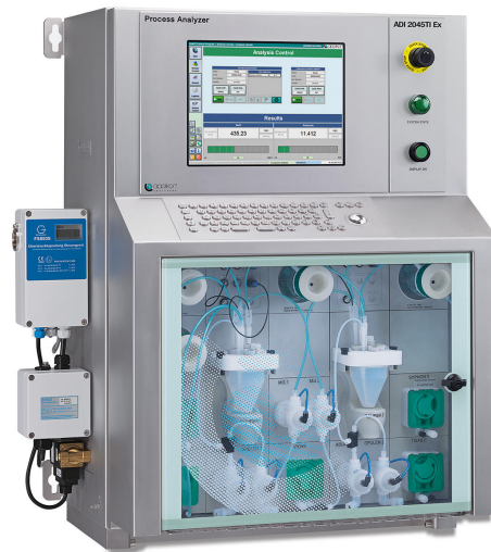
Figure 2. The 2045TI Ex proof Process Analyzer is certified for Zone 1 and Zone 2 areas.

further on in the distillation unit. The analyzer fulfills EU Directives 94/9/EC (ATEX95) and is certified for Zone 1 and Zone 2 areas.