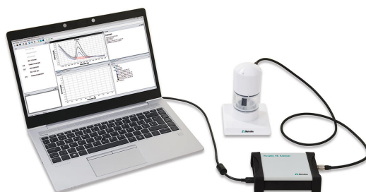
Figure 1. 946 Portable VA Analyzer

The scTRACE Gold is electrochemically activated prior to the first determination.