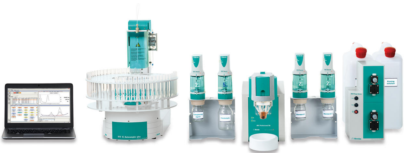
Figure 2. 884 Professional VA fully automated for VA