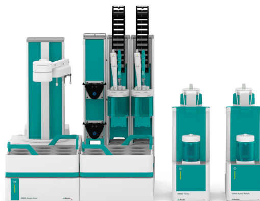
Figure 1. OMNIS Sample Robot, OMNIS Dosing module, and OMNIS Advanced Titrator equipped with fluoride ion selective electrode for the assay of lithium nitrate.

After weighing the sample into the sample beaker, all further steps are automatically carried out by the system. The assay is performed by a precipitation titration with ammonium fluoride in an ethanolic solution.