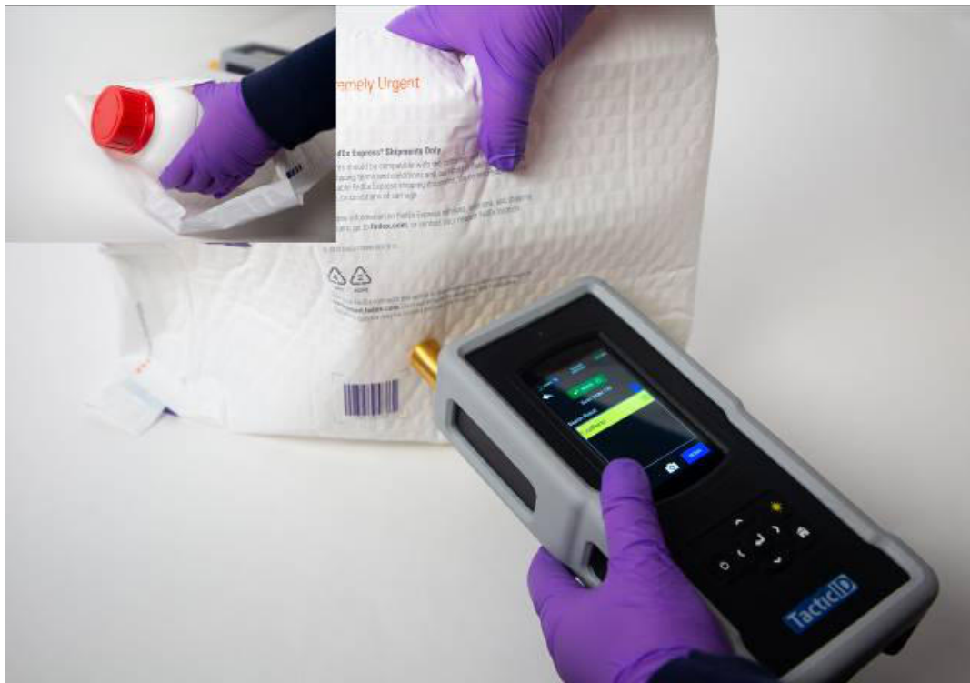
Figure 5. Measurement of white HDPE bottle of caffeine inside white padded package