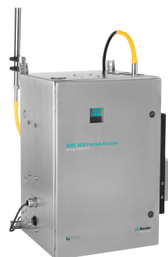
Figure 2. NIRS XDS Process Analyzer from Metrohm Process Analytics.

Wavelength range used: 1100–1650 nm. Inline analysis is possible using a micro interactance reflectance probe with purge on collection tip directly in the fluid bed dryer.