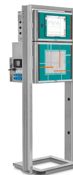
Figure 2. The 2060 The NIR-Ex Analyzer from Metrohm Process Analytics is suitable for use in hazardous areas.

Metrohm Process Analytics manufactures NIRS process analyzers that gather «real-time» spectral data from the process. These are used for comparison to a primary method (e.g., Karl Fischer titration) to create a simple, yet indispensable model to easily monitor QC parameters in near real-time. Gain more control over the refining process with a 2060 The NIR-Ex Analyzer configured for applications in ATEX zones (Figure 2). This process analyzer is capable of monitoring up to five sample points per NIR cabinet with the multiplexer option.