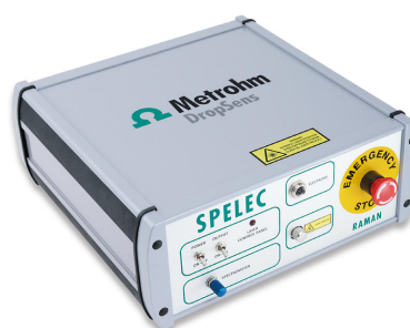
Figure 2. The SPELEC-RAMAN used for the measurements in the application note.

Screen-printed electrodes (refs. DRP-110, DRP-110SWCNT, DRP-110CNT, DRP-110OMC, DRP-110GPH, DRP-110CNF) were placed in a specific cell for this type of devices (DRP-RAMANCELL) coupled with the DRP-RAMANPROBE, which allows to perform the Raman measurements of the electrode surface at optimal focal distance. Integration time was 20 s.