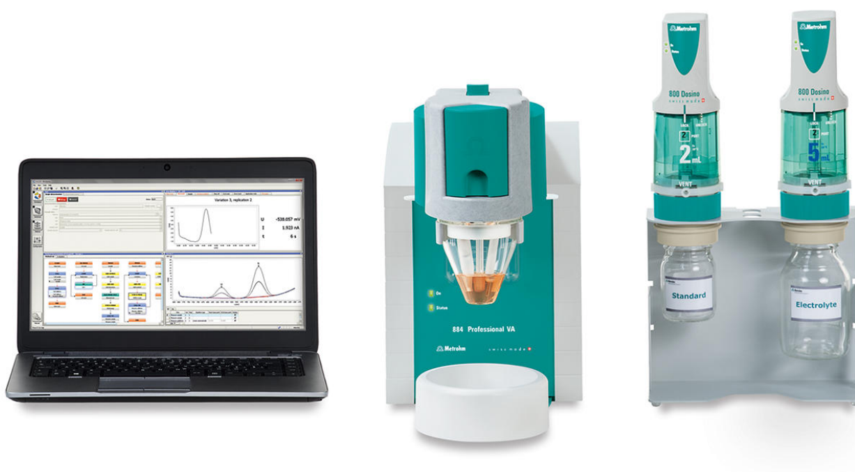
Figure 2. 884 Professional VA, semiautomated for VA analysis