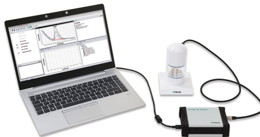
Figure 1. 946 Portable VA Analyzer (SPE)

Prior to the first determination, an ex-situ bismuth film is deposited from a Bi solution. In the next step, the electrodes are cleaned with ultrapure water and the bismuth solution is removed. The water sample is placed into the measuring vessel. Ammonia / ammonium chloride buffer along with the complexing agent (dimethylglyoxime) are added, and the simultaneous determination of nickel and cobalt is carried out using the parameters specified in Table 1 . The concentration is determined by two additions of a nickel and cobalt standard addition solution.