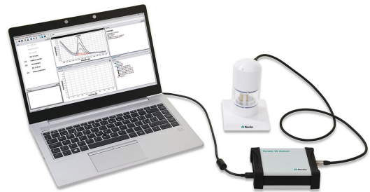
Figure 1. 946 Portable VA Analyzer (SPE)

Prior to the first determination, the ex-situ mercury film is deposited in a separate step on the screenprinted electrode. The water sample and the supporting electrolyte are pipetted into the measuring vessel. The simultaneous determination of cadmium and lead is carried out with the 884 Professional VA or with the 946 Portable VA Analyzer using the parameters specified in Table 1 . The concentration of both elements is determined by two additions of a cadmium and lead standard addition solution.