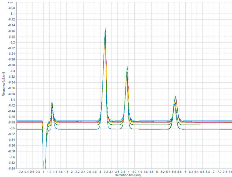
Figure 2. Repeat analyses (n = 100) of a mixed cation standard (lithium 10 mg/L, sodium and potassium 20 mg/L).

0.1–1.1% prove the proper repeatability and robustness are achieved from the dual channel system.