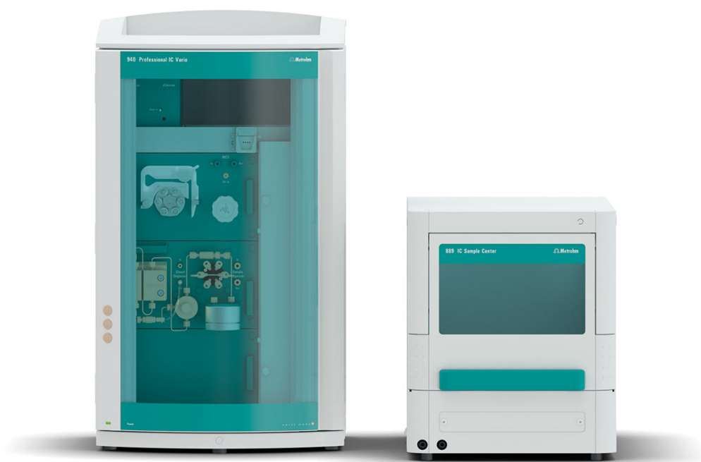
Figure 1. Instrumental setup including a 940 Professional IC Vario ONE/SeS/PP, IC Conductivity Detector (L) and the 889 IC Sample Center (R).

analyzed with a 940 Professional IC Vario using the method parameters given in the respective USP monograph (Table 1).