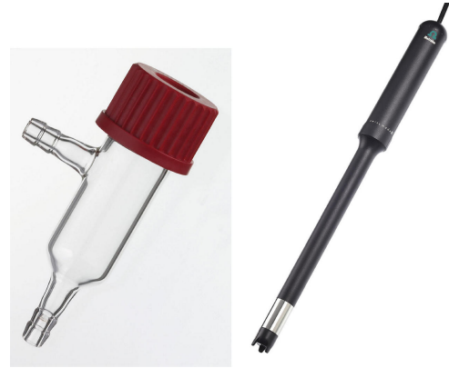
Figure 1. Used flow-through cell (left) and O 2 -Lumitrode (right).

The sensor is inserted and fixed into a flow-through cell, where the inlet is connected to the outlet of the water supply.