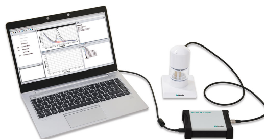
Figure 1. 946 Portable VA Analyzer (SPE)

Prior to the first determination, an ex-situ bismuth film is deposited from a Bi solution. In the next step, the electrodes are cleaned with ultrapure water and the bismuth solution is removed. The water sample is placed into the measuring vessel. Ammonia / ammonium chloride buffer along with the complexing agent (dimethylglyoxime) are added, and the simultaneous determination of nickel and cobalt is carried out using the parameters specified in Table 1 . The concentration is determined by two additions of a nickel and cobalt standard addition solution.