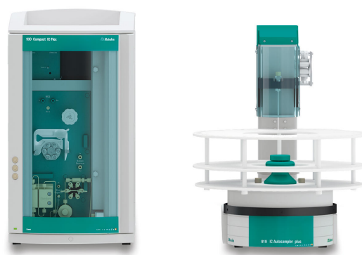
Figure 1. Instrumental setup including a 930 Compact IC Flex with IC Conductivity Detector and a 919 IC Autosampler plus.

The samples were injected directly into the ion chromatograph (Figure 1) without further sample preparation and analyzed using the method parameters given in the USP monograph (Table 1). Anionic components were separated isocratically on a Metrosep A Supp 1 - 250/4.0 column containing the alternative packing material L46. The conductivity signal was detected after sequential suppression.