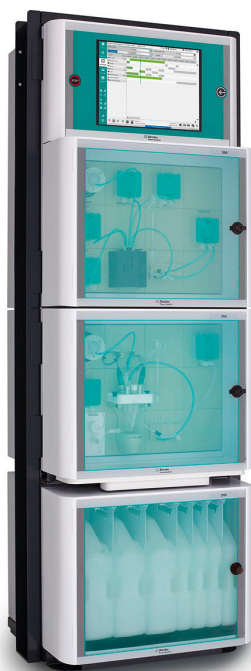
Figure 2. 2060 TI Process Analyzer used for online monitoring of hydrogen peroxide in salmon delousing baths.