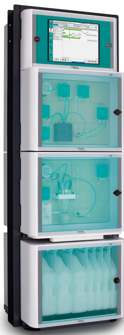
Figure 2. 2060 TI Process Analyzer for the online analysis of critical quality parameters in pickling baths using the method of titration.

Metrohm Process Analytics offers a multi-parameter process analyzer that is suitable for the simultaneous analysis of \text{Fe}^{2+}/\text{Fe}^{3+} and free acid/total acid ratio over a wide concentration range—the 2060 TI Process Analyzer (Figure 2).