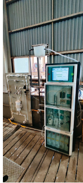
Figure 2. 2060 TI Process Analyzer with preconditioning panel in a zinc refining plant.

( Figure 2 ). Other combinations of measurements (e.g., pH), as well as measurement points taken from multiple streams, can be realized with this process analyzer.