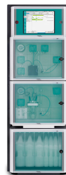
Figure 2. 2060 Process Analyzer for online analysis of ammonia and hydrogen sulfide in the sour water stripping process.

The 2060 Process Analyzer can analyze H 2 S and NH 3 simultaneously with automatic cleaning and calibration steps using absolute wet chemical techniques. Sulfide (S 2- ) is determined by a precipitation titration with silver nitrate (AgNO 3 ). Ammonia is determined by Dynamic Standard Addition (DSA). Fast and accurate results are continuously transmitted to the programmable logic controller (PLC) for process control.