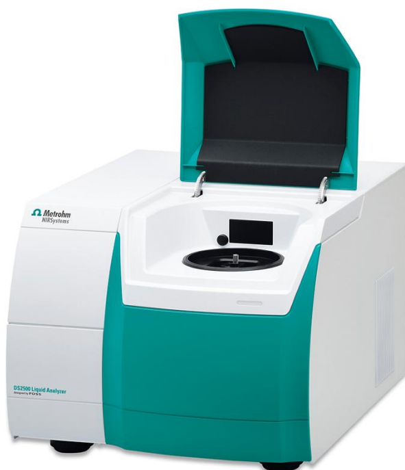
Figure 1. Metrohm DS2500 Liquid Analyzer used for the determination of research octane number (RON) in isomerate samples.