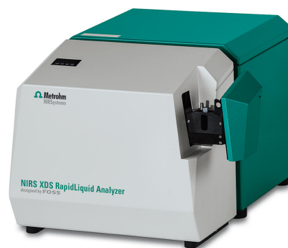
Figure 1. The NIRS XDS RapidLiquid Analyzer with a 1 mm quartz cuvette, used to collect the spectra of surfactant samples.

A total of 37 samples with varying surfactant content were provided by a customer. The Vis-NIR spectra (Figure 2) were acquired on a Metrohm NIRS XDS RapidLiquid Analyzer equipped with 1 mm quartz cuvette (Figure 1). The samples were measured as-is, without any sample preparation steps. Data collection and model development was carried out with the Vision Air complete software package.