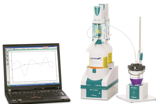
Figure 1. 859 Titrotherm setup for the thermometric titration and the data evaluation performed with tiamo.

An appropriate amount of sample is weighed precisely into the titration vessel. Deionized water is added to dissolve the sample, which is then titrated until after the exothermic endpoint with standardized STPB is reached.