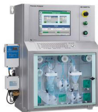
Figure 2. ADI 2045TI Ex proof (ATEX) Analyzer.

Chloride is analyzed with conductivity detection as described in ASTM D3230 with the ADI 2045TI Ex proof Analyzer (Figure 2).