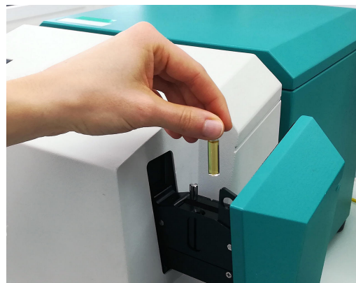
Figure 1. XDS RapidLiquid Analyzer and a polyol sample present in a 4 mm disposable vial.

Polyol samples were measured with the XDS RapidLiquid Analyzer in transmission mode over the full wavelength range (400–2500 nm). Reproducible spectrum acquisition was achieved using the built-in temperature control (at 30 °C) of the XDS RapidLiquid Analyzer. For convenience, disposable vials with a path length of 4 mm were used, which made cleaning of the sample vessels unnecessary. The Metrohm software package Vision Air Complete was used for all data acquisition and prediction model development.