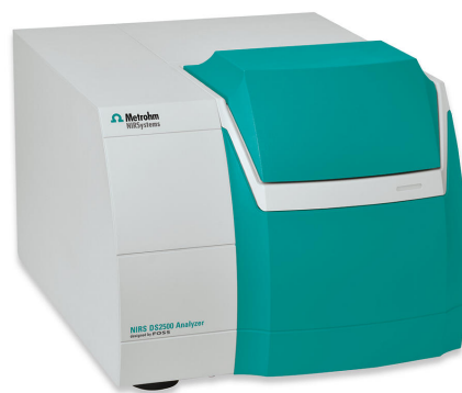
Figure 1. DS2500 Solid Analyzer

Several 250 µm PVC foils coated with a PVDC layer of varying thickness (40 g/m 2 , 60 g/m 2 , 90 g/m 2 ) were measured on the DS2500 Solid Analyzer. The measurements were carried out in transfection mode using the NIRS gold diffuse reflector with 1 mm pathlength. This ensures that the spectral pathlength is constant while enhancing the spectral signal. The Metrohm software package Vision Air Complete was used for all data acquisition and prediction model development.