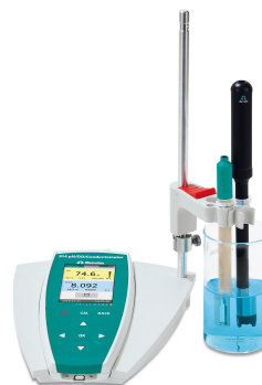
Figure 1. 914 pH/DO/Conductometer equipped with an O 2 -Lumitrode for the determination of dissolved oxygen in juices.

The prepared sample is carefully opened and the O 2 -Lumitrode is placed directly into the sample. The measurement is started, and the DO content is measured until a stable value is reached. Afterwards, the sensor is removed and rinsed well with deionized water. If necessary, blot dry. For each analysis, a new sample bottle is opened. The sensor is stored dry with mounted calibration vessel for protection.