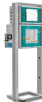
Figure 3. The 2060 The NIR-Ex Analyzer from Metrohm Process Analytics.

Each Metrohm Process Analytics 2060 The NIR-Ex Analyzer is configured for applications in ATEX zones. These instruments are capable of monitoring up to five process points per NIR cabinet with the multiplexer option.