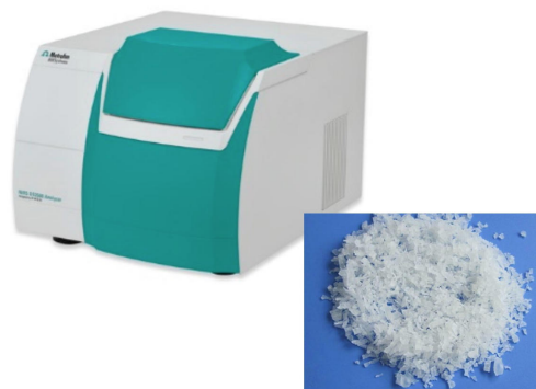
Figure 1. The DS2500 Solid Analyzer was used to collect the spectra of PVA polymer.

54 spectra from 18 different sample batches were collected using a Metrohm DS2500 Solid Analyzer in combination with the Vision Air Complete spectroscopy software. To overcome sample inhomogeneity, the measurement was performed with a large sample cup in rotation. The reference values were obtained by titration. Outlier detection was performed on pre-processed spectra (2 nd derivative) using a maximum distance in wavelength space algorithm. The NIRS prediction model was created with the settings described in the following table, and validated using cross validation.