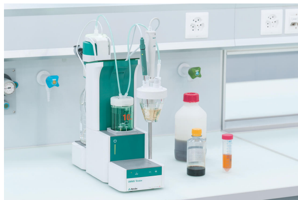
Figure 1. OMNIS Titrator Professional equipped with a dThermoprobe and a rod stirrer.

An appropriate amount of sample is weighed into the titration vessel, and solvent as well as paraformaldehyde are added. Afterwards, the solution is titrated until after the first exothermic endpoint with standardized potassium hydroxide (Figure 2).