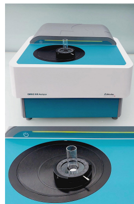
Figure 1. OMNIS NIR Analyzer Solid with 15 mm vial and Flexible holder OMNIS NIR.

The reference values were measured according to USP<922> Water Activity [3].