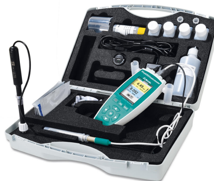
Figure 1. Transport case including all accessories and a 914 pH/DO/Conductometer equipped with an O 2 -Lumitrode and conductivity sensor for the determination of dissolved oxygen in a freshwater stream.

The sensors are both directly inserted into the surface water at the point of interest, to a depth of at least 3.5 cm.