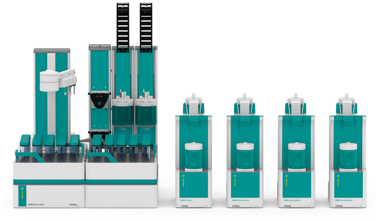
Figure 1. OMNIS Robot S with Discover and parallel analysis.

OMNIS automates the entire analysis process with: