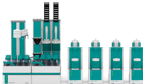
Figure 1. The OMNIS Sample Robot S equipped with an OMNIS Professional Titrator, plus a corresponding amount of OMNIS Dosing Modules to add all necessary solutions, and dPt Titrode for the automated determination of iodine value.