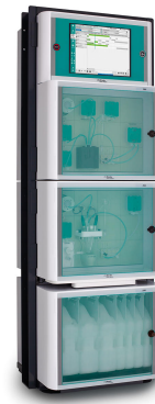
Figure 2. 2060 Process Analyzer from Metrohm for online monitoring of hydrogen peroxide during the CMP process.

Other combinations of measurements, as well as measurement points taken from a single process stream or even multiple streams, can be realized across the Metrohm Process Analytics product portfolio. All platforms guarantee fast, accurate results continuously available for true process control.