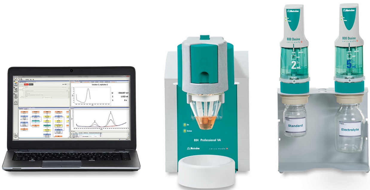
Figure 2. 884 Professional VA semiautomated