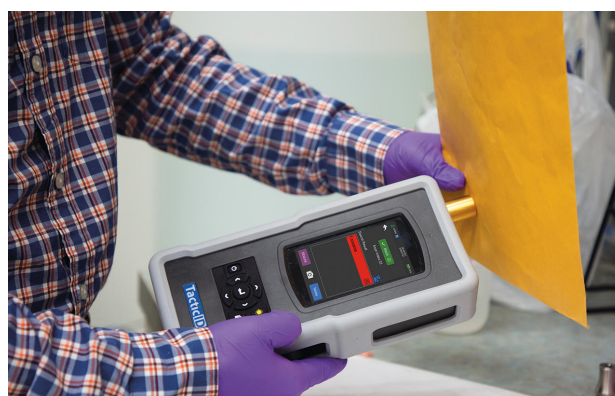
Figure 1. TacticID-1064 ST measuring a sample through a manila envelope with ST adapter